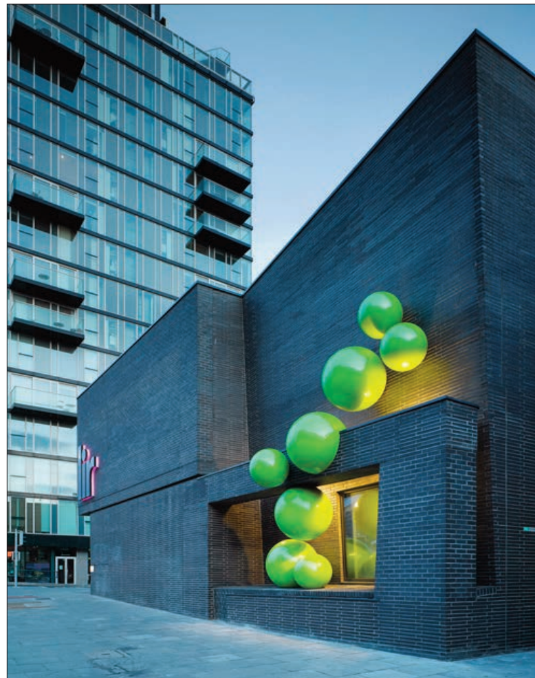
The Lir, National Academy of Dramatic Art at Trinity College Dublin

A project to provide accessible pathways across the cobbled areas through the main Front Square was completed in early 2012. These pathways provide accessible routes from the main College Green