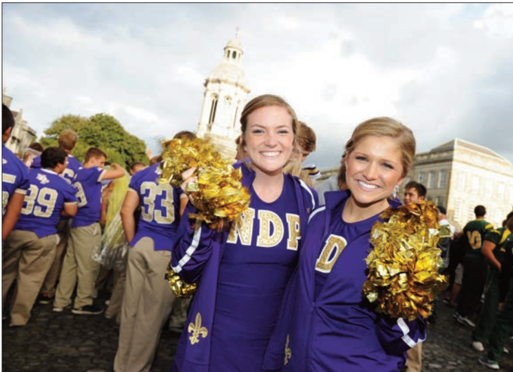
Cheerleaders at the Pep Rally in Front Square